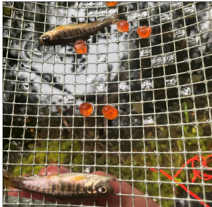
Figure 1.—Juvenile coho salmon captured at waypoint 1343.