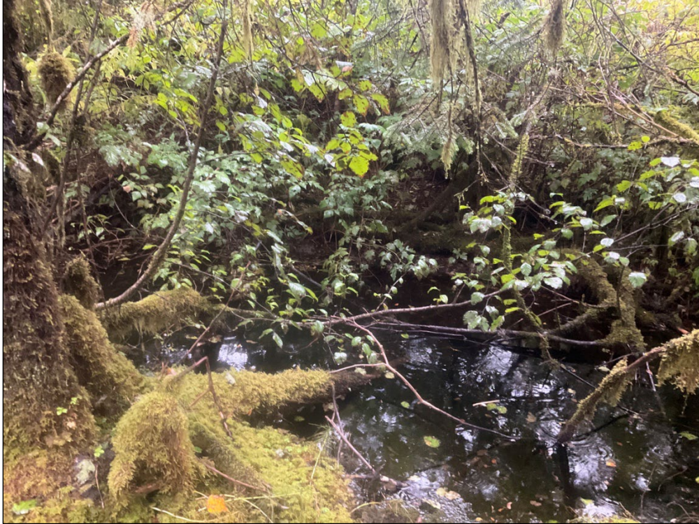
Figure 2.—Ponded water in ditched channel looking downstream at waypoint 1343.