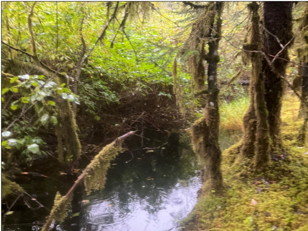
Figure 3.—Ponded water in ditched channel looking upstream at waypoint 1343. .